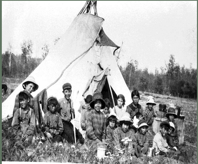
Out on a picnic.....years ago.

LAND SEARCHES: August 22-24, 2023, Elder/Survivor Gathering was held; additional and new areas identified for GPR for both St. Martin's and St. John's former residential schools to search for unmarked graves. Report is forthcoming in 2024.